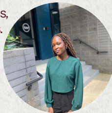
Computer Science Major, Data Science Minor, Class of 2026

As a Sumeru Fellow, I engaged in numerous activities, including a Stock Portfolio Game, Market Watch analysis, Speaker Series, mentorship meetings, and social events. These experiences have been immensely rewarding, boosting my confidence and exposing me to various career paths in the industry. Reflecting on my internship experience, there hasn't been one single moment in this internship that has been game-changing or pivotal. Rather, there have been a series of incredible memories, conversations, and experiences. It's the little things that come together, bringing with it an unforgettable journey.