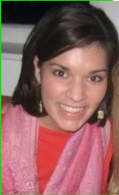
Goodbye to our good friends in Social Work and Ledford Hall...

ciology major coursework has helped me learn so much about the world we live in and the social interactions that take place on a daily basis. Everything we do is sociology and that's what makes it so interesting! Several of the classes I have taken for my major as well as my women's studies minor have helped me form the decisions I have made about my future life's work.