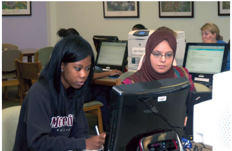
The Carlyle Campbell Library continues to evolve in order to more effectively meet students' needs in a rapidly-changing learning and research environment.