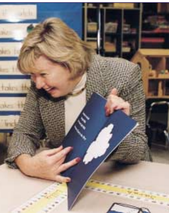
Volunteers who work with local elementary school children to help kids who learn to read at a young age develop a relationship particularly important," she says.

ing with her—is more important to her than the reading we do.”