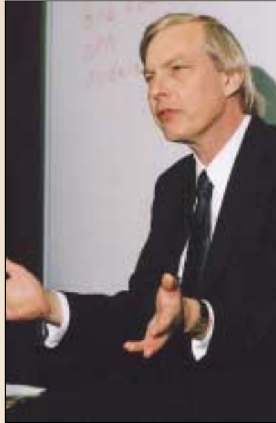
Bob Edwards, host of NPR's Morning Edition, served as a guest lecturer for a media writing class following his convocation address.

Edwards and Morning Edition have won numerous awards, including the